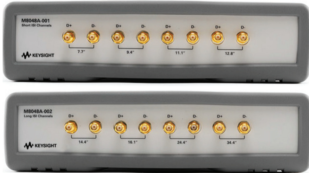
Figure 3: Front panel view of M8048A option 001 (top) and M8041A option 002 (bottom).