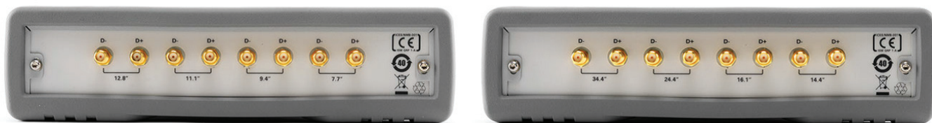
Figure 6: Rear panel view of M8048A-001 (left) and M8028A-002 (right).