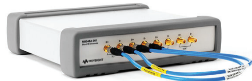
Figure 7: Short matched SMA cable pair for cascading ISI channels from two units or within one unit.